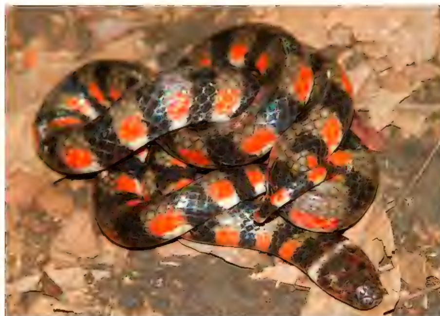
Fig. 1. Hydrops triangularis (MUSA 4749) collected at Pampas del Heath National Sanctuary, Madre de Dios region, Peru.